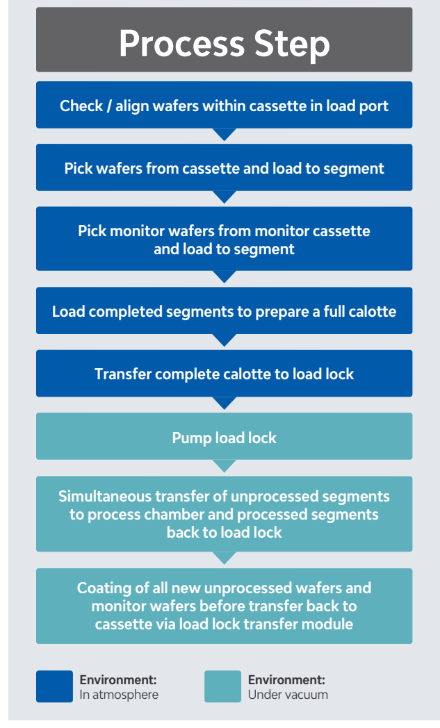
Figure 4: From cassette to coater in the MULTI BAK in a few simple steps.

Imagine increasing production output by 70% for a single tool